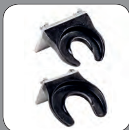
2 spring holders (78 - 125 mm and 125 - 200 mm).