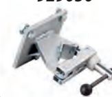
Strut vice. Recommended for BMW 3-serie, Toyota RAV4, Toyota Avensis.