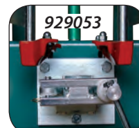
Low lip jaws for some Japanese produced cars.