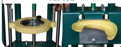
Mercedes A, B, C and E Class bracket (C-class until 2009).